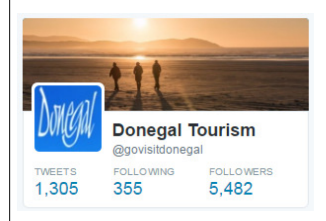
Twitter - 5.4K Followers